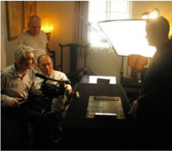
Filming a traditional calligraphy artist in Beijing for an Olympics corporate hospitality event video for the DOW Corporation