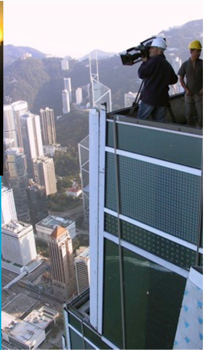
Atop the almost completed Two IFC filming birds-eye view scenes for a property marketing promotion